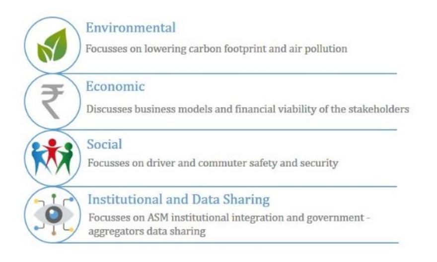
Figure 2: Sustainability themes

While analysing the existing measures to regulate ASM services and identify the policy gaps, we found it necessary to categorise the policy questions into various themes contributing to sustainable mobility. The sustainability themes identified for this study are given below: